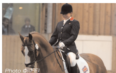
Para Dressage World Champs p.5