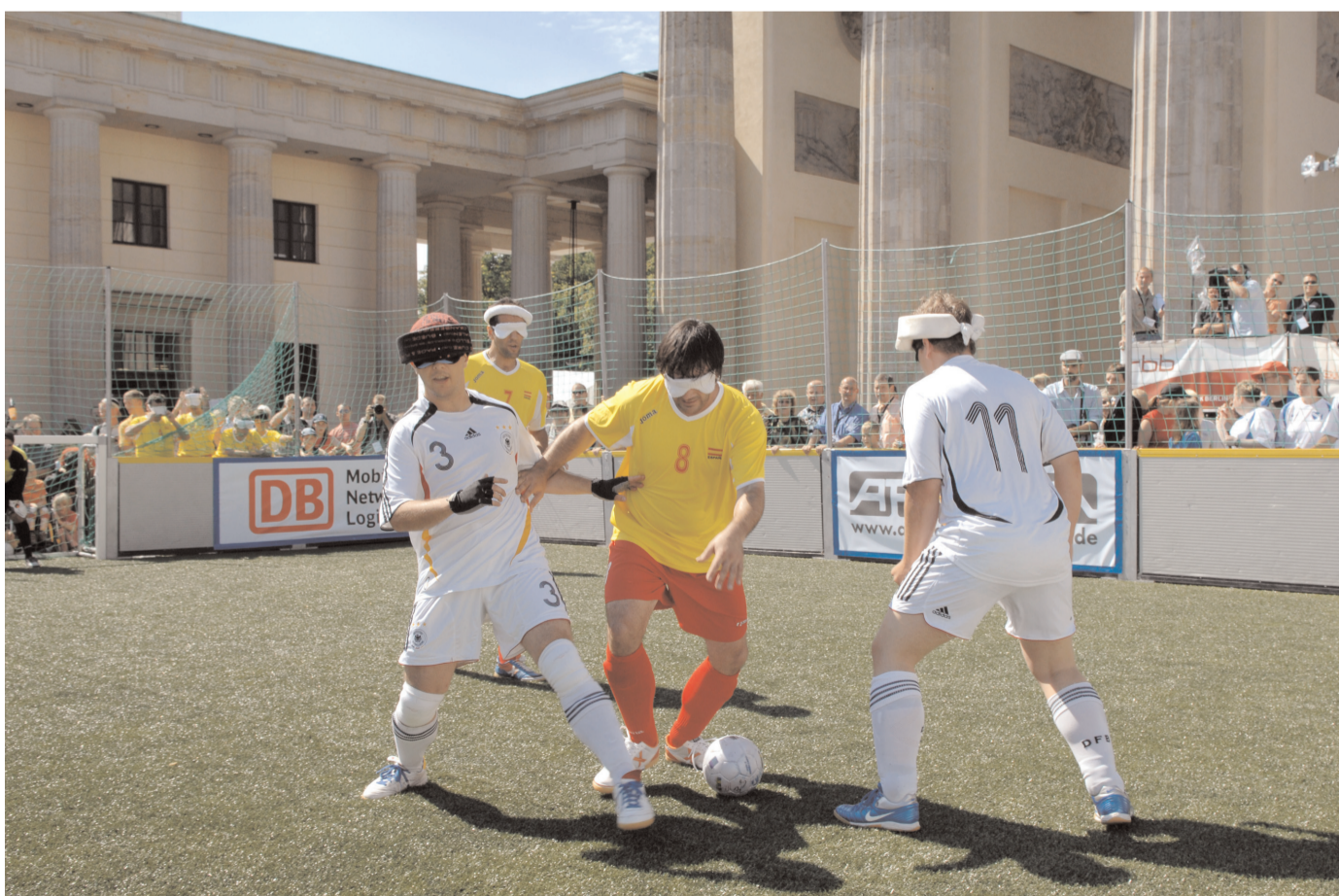
Wheelchair Basketball and Football 5-A-Side were just two of the sports featured at IPD 2007.