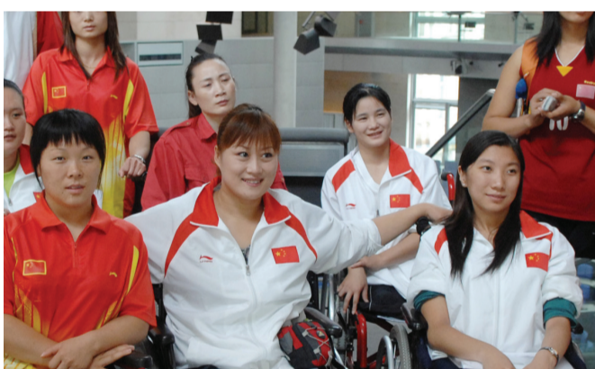
China's National Women's Basketball Team in action at IPD 2007