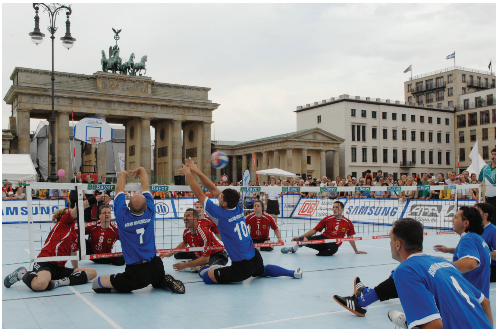
Action from the IPD 2007 in Berlin

Ice Sledge Hockey Scientific Research p.11