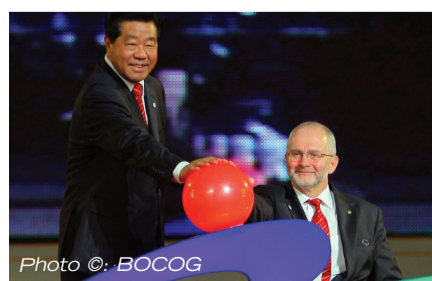
One-year out 2008 Beijing Paralympic Games p.2