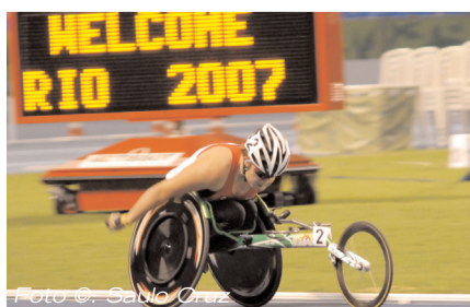
2007 Rio Parapan American Games p.8