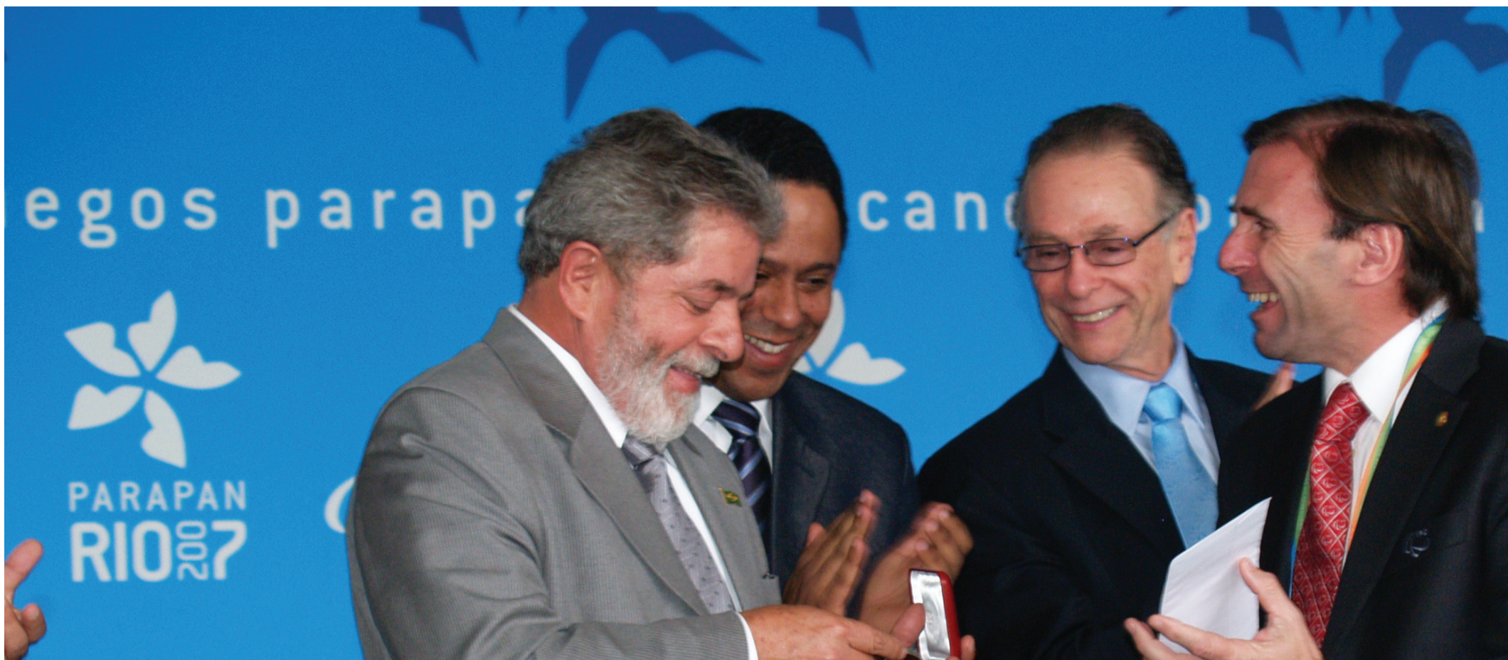
Brazilian President Lula receives Paralympic Honour