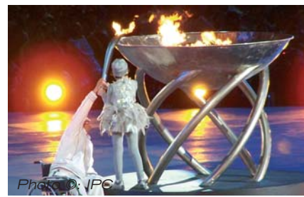
Torino 2006 Paralympic Experiences p.9