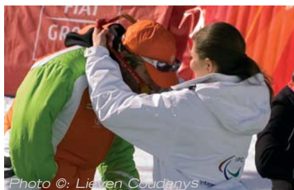
Paralympic Honorary Board p.5