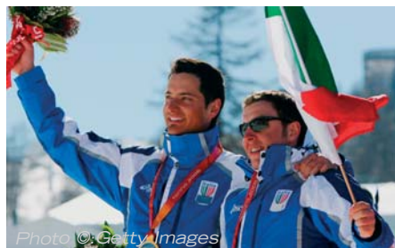
Top Athletes from Torino p.8