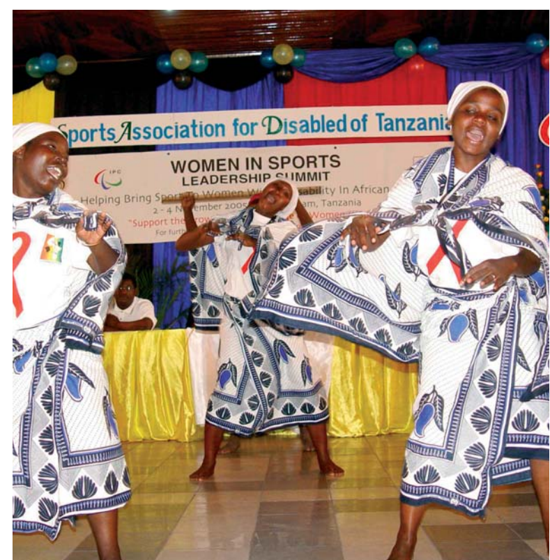
Performers entertain at the IPC Women in Sport Leadership Summit held in Tanzania.

UK Sport, who began working with the IPC in 2005 with their support for the IPC Women in Sport Leadership Summits in Africa, will continue to work with IPC in collaboration with Commonwealth Games Canada (CGC). The two organizations have committed additional funds in 2006 and beyond to support projects that foster sport and human development through Paralympic sport. Support in 2006 will impact the National Paralympic Committees in Tanzania, Namibia and Zambia. Funds will be used to develop youth programmes, in particular for athlete recruitment and training, needs based assessments and capacity building. These activities fall under UK Sport's Worldwide Impact Strategy (WWI) and CGC's International Development Through Sport Initiative.