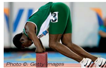
Commonwealth Games Round-up p.10