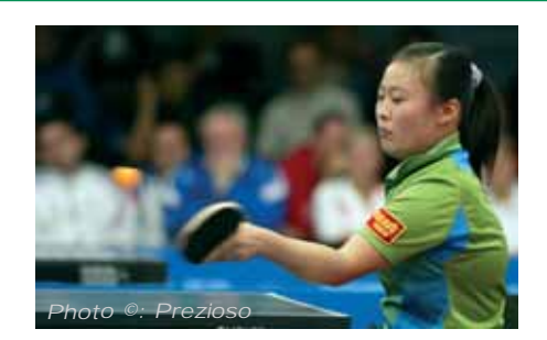
Europe Hosts IPC World Championships p.8