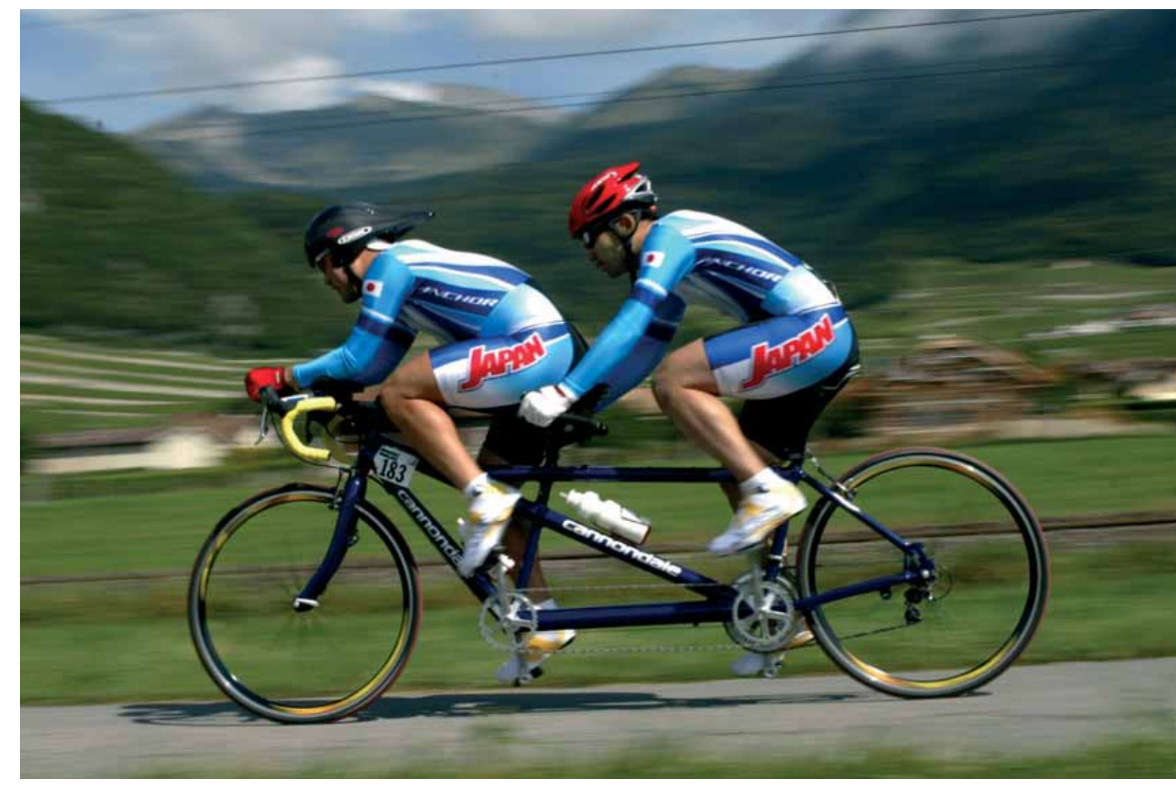
Japan in action on the road at the 2006 IPC Cycling World Championships.