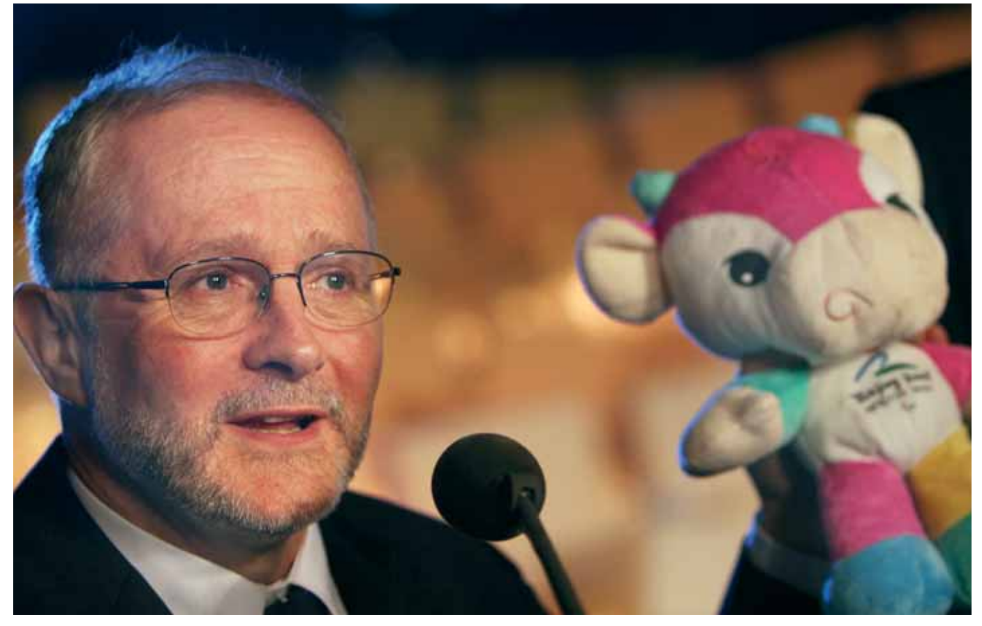
Sir Philip introduces Lele, the official mascot of the Beijing 2008 Paralympic Games.

The Beijing 2008 Paralympic Games will take place from 6 to 17 September 2008, with around 4,000 athletes from 160 countries competing in 20 sports.