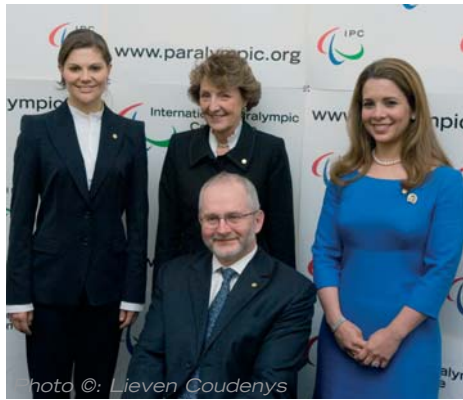
IPC President Sir Philip Craven with HRH Crown Princess Victoria of Sweden, HRH Princess Margriet of the Netherlands and HRH Princess Haya Bint Al Hussein of Jordan.

On March 2, members of the IPC Honorary Board came together for the first time at the IPC Headquarters in Bonn, Germany. The Honorary Board met to discuss their goals and future steps to develop the Paralympic Movement, conduct advocacy to achieve equality for persons with a disability and increase the awareness and profile of the Paralympic Movement.