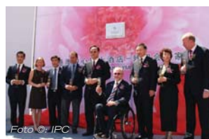
Paralympic Family Hotel Signing p.9