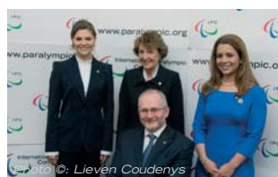
First IPC Honorary Board Meeting p.8