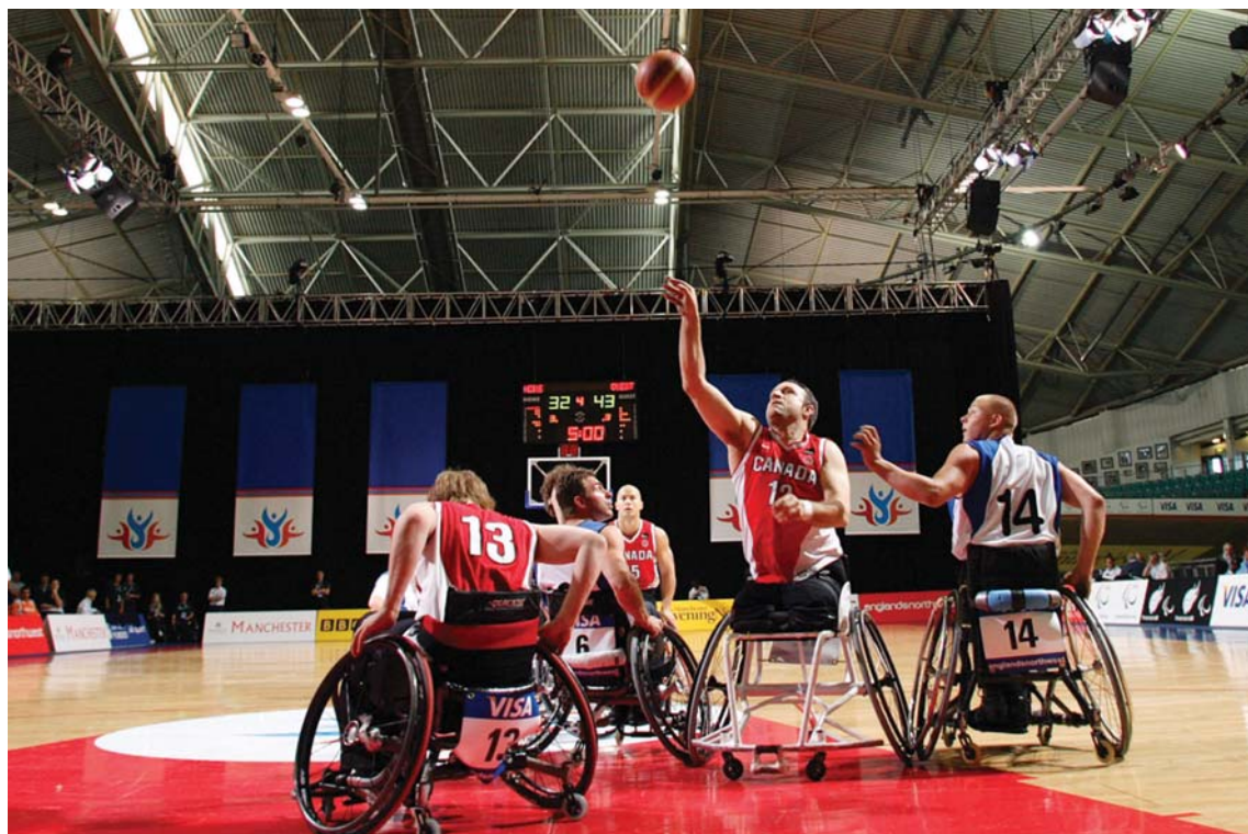
Action from the 2007 Visa Paralympic World Cup.