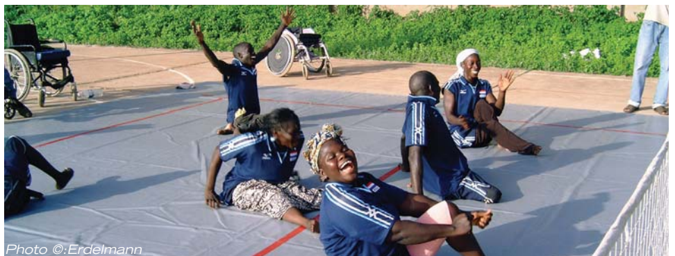
The IPC Development Grants covered a spectrum of opportunities.