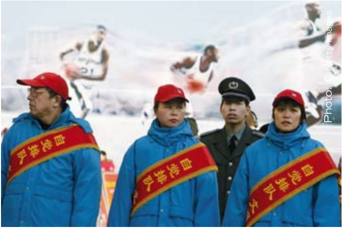
Beijing workers assist in National “Queuing Day”

Approximately 4,000 campaign guiders were street-bound for the launch, helping more than one million people line up at 1,800 different bus stops. The massive undertaking jump-started the now more organized, guide-free lines found at hospitals, supermarkets, post offices and other public places.