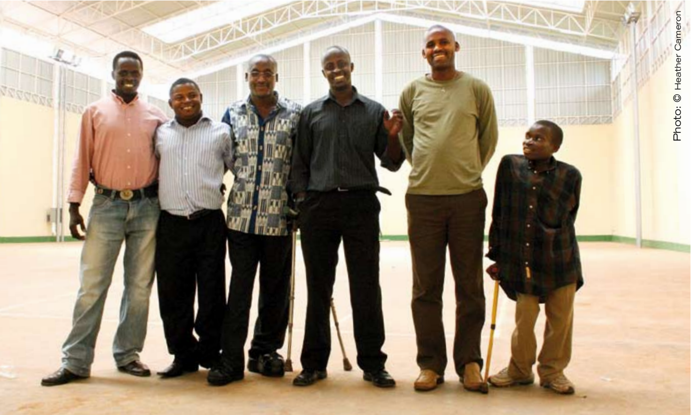
NPC Rwanda inside their new facility

ODI is more about developing the core of NPCs, by providing them with support in cultivating their inner capacity and capabilities. With approval from the Governing Board, IPC is concentrating on organizational development.