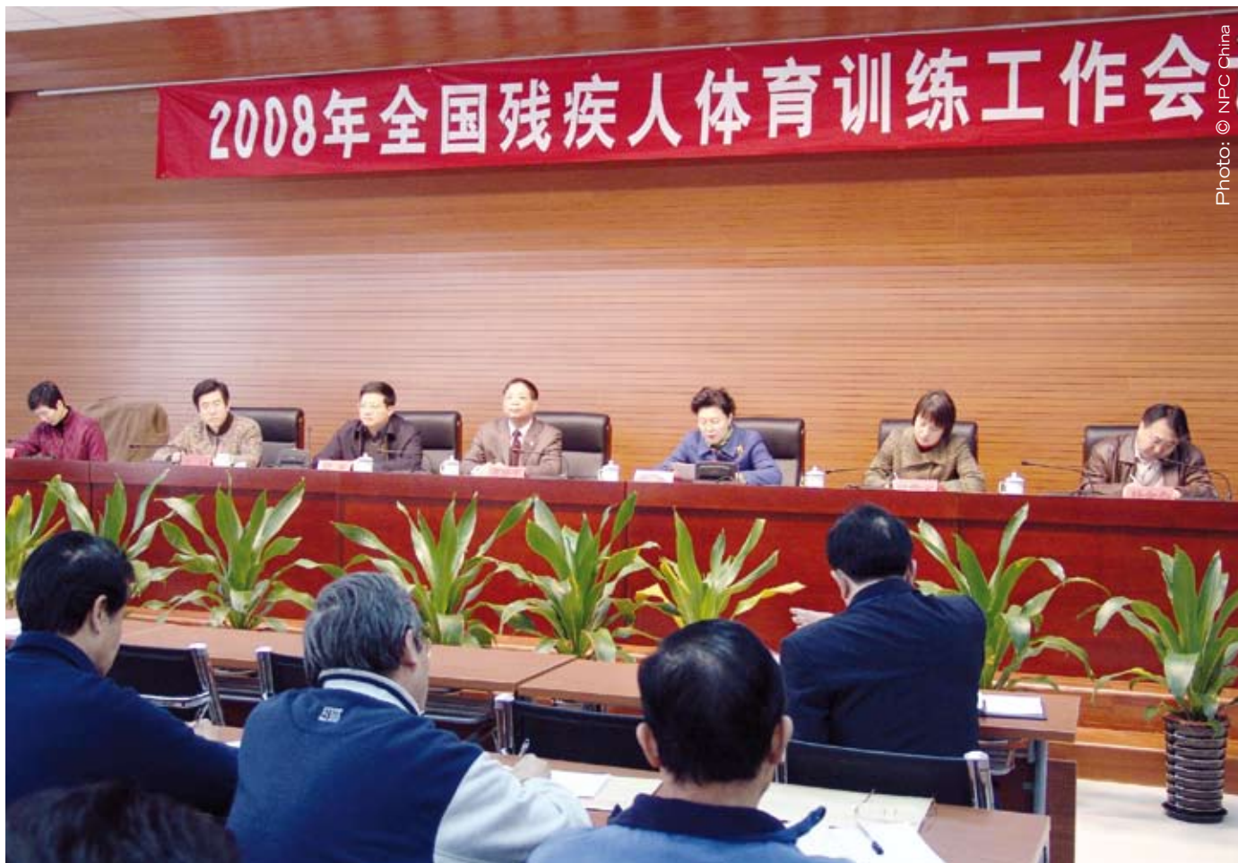
NPC China holds a national meeting on training

The Paralympian interviewed NPC China about their upcoming role in the Beijing Games.