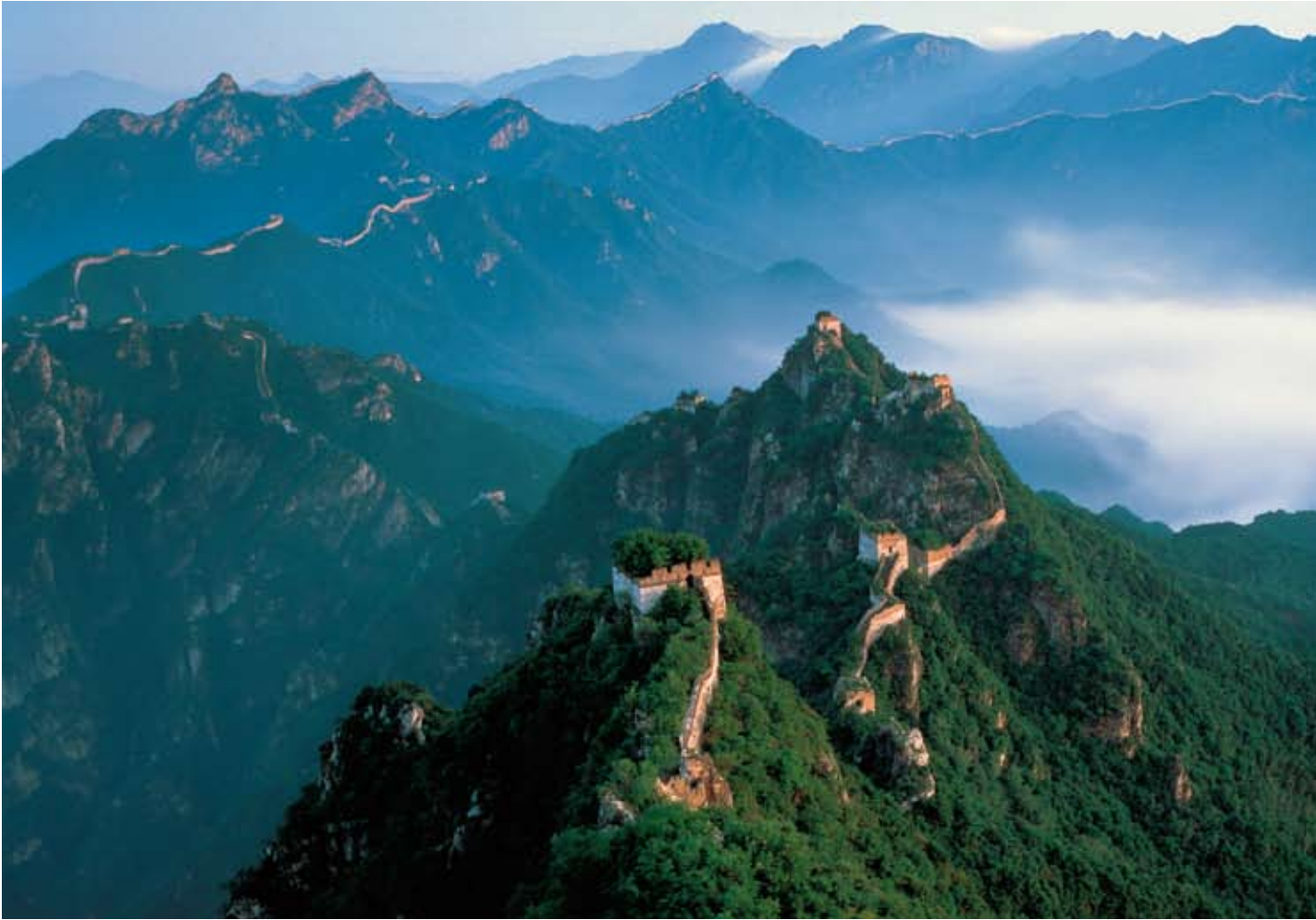
The Great Wall with its dramatic backdrop