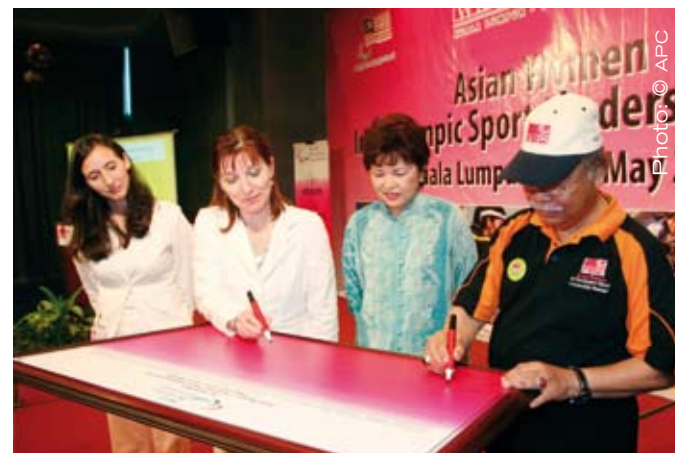
Closing Ceremony signing of the Kuala Lumpur (KL) Declaration at the Summit.

I have just returned from facilitating my third IPC Women in Sport Summit. In addition to developing action plans for women in sport projects, the sessions are designed to provide skills and motivation to the participants. As content leader for the sessions, I ended up learning a lot more than what I taught. In addition to new knowledge, I left each Summit with a renewed energy and enthusiasm!