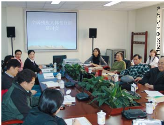
NPC Classifier's Seminar in March

We should say that the Paralympic mascot has preference to the Chinese competitors because China as an agriculture-strong country has a stronger preference to cows. The image of the Fu Niu Lele implies not only the Chinese traditional culture but also the common nature of athletes with a disability. Cows are everywhere and are friends of all people in the world. Therefore, Fu Niu Lele belongs to the world, representing such positive attitudes towards life as solid work, persistence, never give-up, honesty, optimism and diligence.