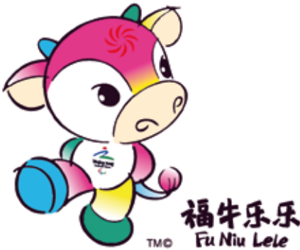
The curious Lele

After careful consideration for perfect representation, Lele was chosen as the Official Mascot of the Beijing 2008 Paralympic Games. Well, the full name is actually Fu Niu Lele, but to promote its image ambassadorship of friendship, the preference becomes a shortened Lele. ‘Lele’, which means “Happiness”, is the name of the cow that will invite people from across the globe to come to Beijing