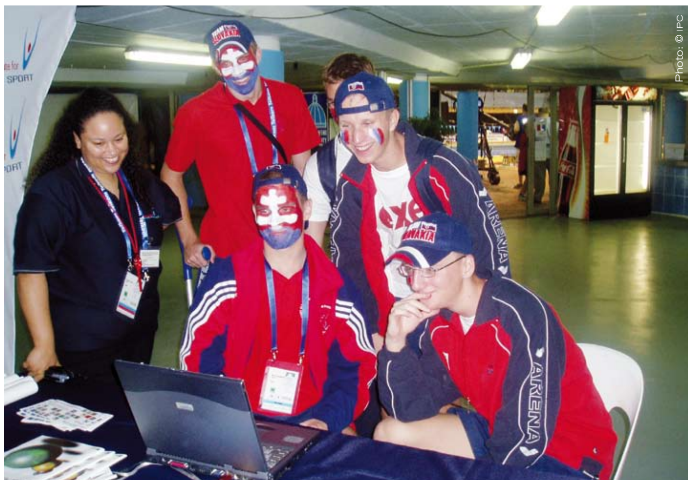
Athletes taking the Anti-Doping Education Quiz