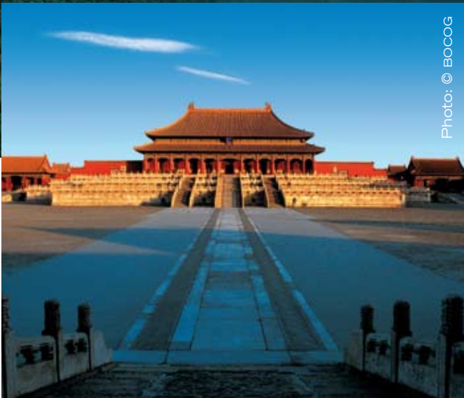
The landmark Hall of Supreme Harmony at The Forbidden City