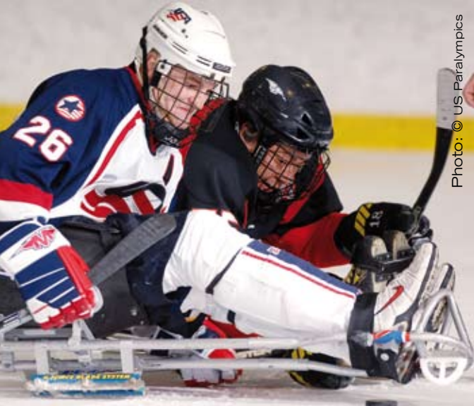
Canadian player blocks goal attempt

For more information, visit www.paralympic.org .