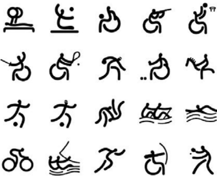
Beijing Paralympic Pictograms