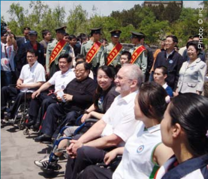
IPC President Sir Philip Craven at the Great Wall