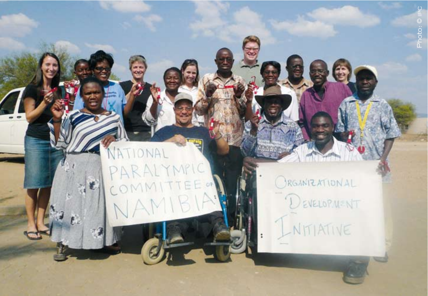
NPC Namibia with IPC staff during a workshop

NPCs can apply for the ODI on a yearly basis. Between five to eight NPCs will be selected to enter the ODI each year depending on the level of resources available.