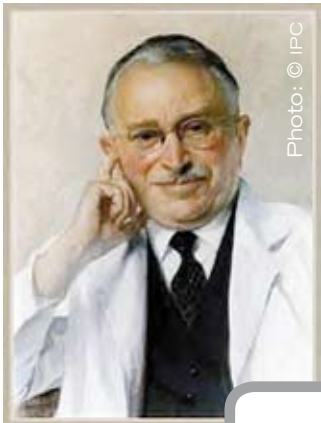
Founder of IPC