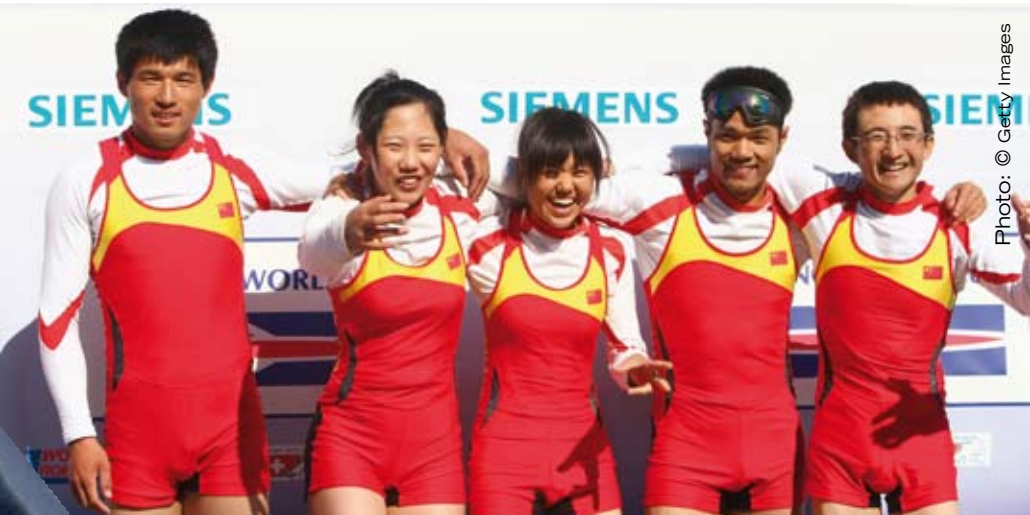
Chinese Rowing Team celebrates qualification

As a result of the World Championships, a total of 22 countries will be participating in the Paralympic Rowing Regatta in Beijing: four Asian, one African, three from the Americas, one from Oceania, and 13 European. These athletes will now compete in the Games, in addition to the 64 rowers who qualified at the 2007 World Rowing Championships on the same course in Munich last year.