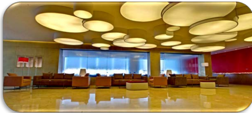
Free Internet in the Lobby