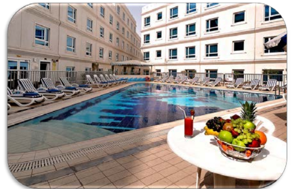
Accessible Swimming Pool